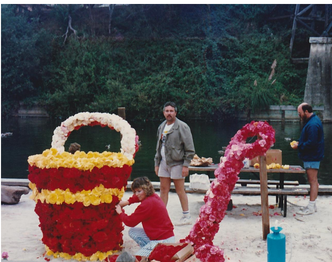
Kid's beach bucket and shovel getting last minute attention

Residential displays in the last few Begonia Festivals have evolved into smaller, less labor- and begonia-intensive, fun displays like this "photo-op"