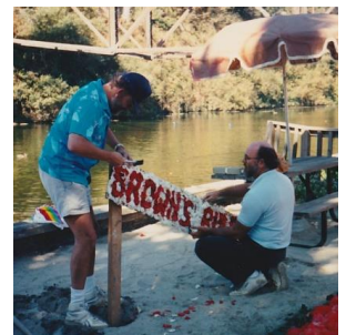
Last second Sunday morning revisionism

In that distant time, there were plenty of floats being built each year and more importantly, plenty of begonia blossoms to be picked, placed, and positioned in fanciful chicken-wire structures on decks and yards along the Creek and in the Village.